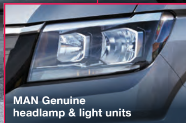
MAN Genuine headlamp & light units