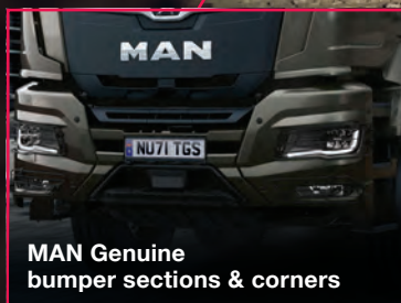
MAN Genuine bumper sections & corners