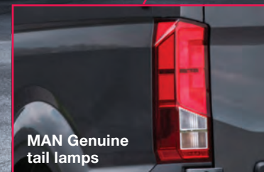
MAN Genuine tail lamps