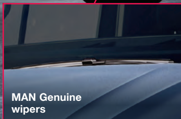
MAN Genuine wipers