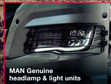
MAN Genuine headlamp & light units