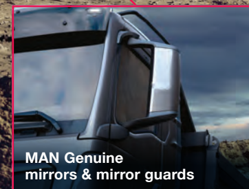
MAN Genuine mirrors & mirror guards

CONTACT YOUR LOCAL DEALER FOR MORE INFORMATION ON OUR LATEST 8X4 OFFERS.