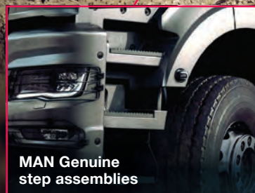
MAN Genuine step assemblies