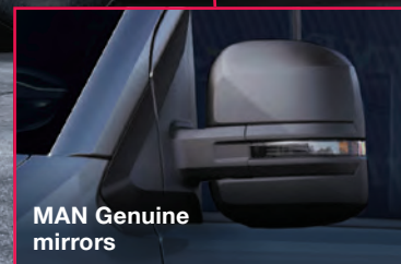
MAN Genuine mirrors