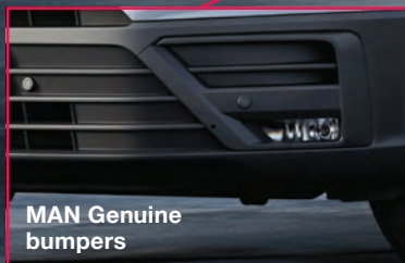
MAN Genuine bumpers